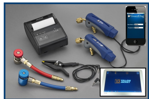
Diagnostic automotive tool with 3 sensors and 3 Bluetooth radios communicating continuously to an ACS-developed app on both a Windows tablet or on iOS or Android smartphones. Also includes a 4th Bluetooth interface to a dedicated custom-configured wireless printer. Also includes WiFi cloud-based remote monitoring.