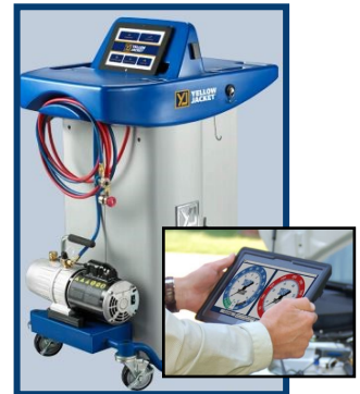
Automotive A/C recovery unit with 2 Bluetooth radio connections to ACS-developed Window's tablet app.

Philosophy/Approach: We consider ourselves more than product development experts who develop electronic products for our clients. We are also consultants to our customers who desire to develop their own expertise and competency in electronic product development.